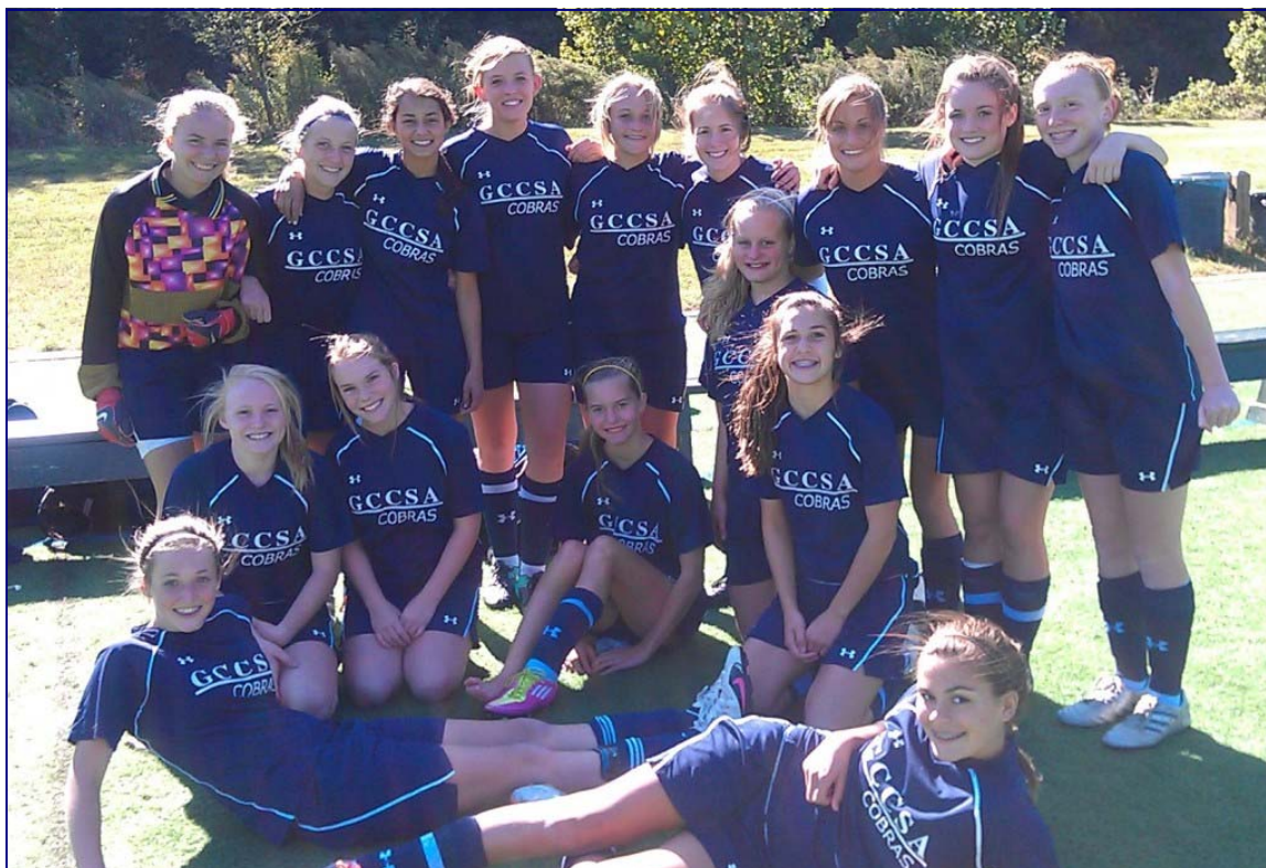
'96 Lady Cobras Team Photo

Congratulations '96 Lady Cobras on a great season!