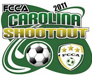
'96 Lady Cobras

Good Luck Lady Cobras. We are proud of you!