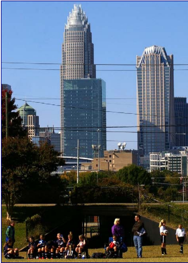
The Charlotte skyline as viewed from the sidelines of Independence Park.

The '99 Lady Cobras travelled to Charlotte to take on Charlotte United Futbol Club (CUFC) Speed Hanover this past weekend.