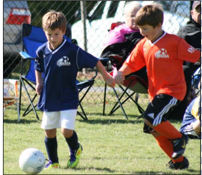
Players From Alston Bridges BBQ and Emergency Medical Physicians U8 teams.